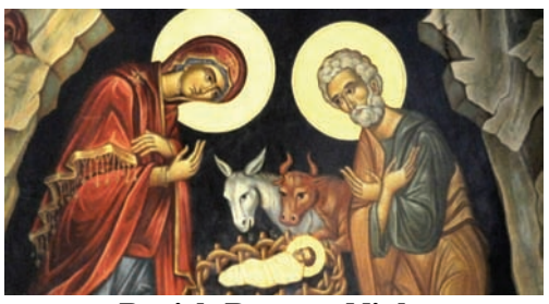
Parish Retreat Night The Birth of Jesus Friday, December 17 at 7 pm